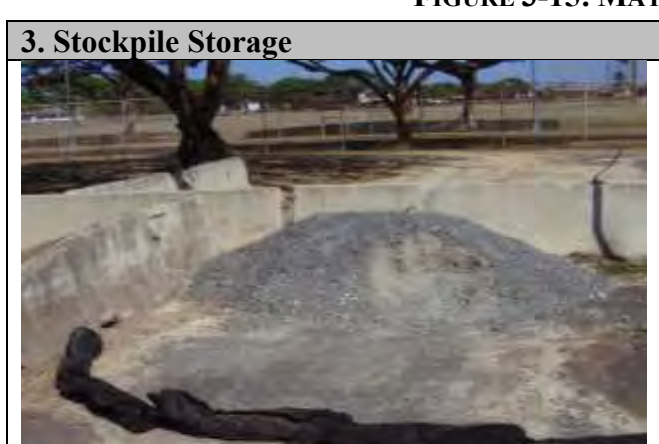
FIGURE 3-15: MATERIAL STORAGE

Ensure that stockpile contact with storm water is minimized.