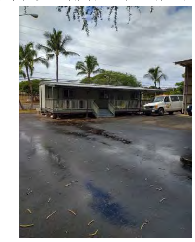
FIGURE 3-1: BASEYARD FUNCTIONAL AREAS – ADMINISTRATIVE BUILDING